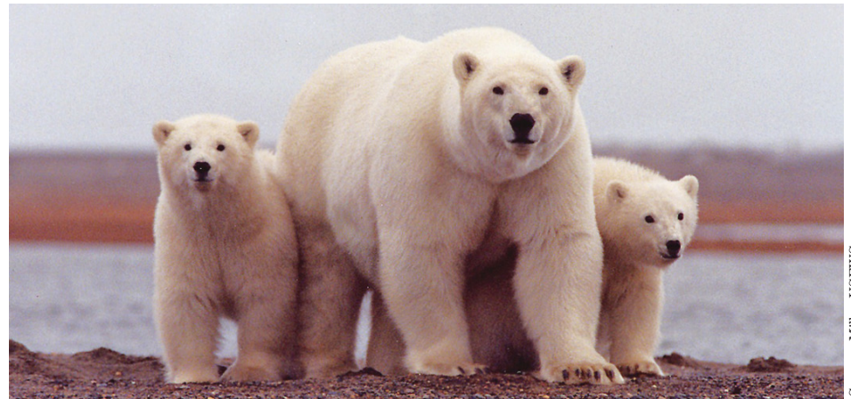
Susanne Miller, USFWS

A species is listed under one of two categories, endangered or threatened, depending on its status and the degree of threat it faces. An "endangered species" is one that is in danger of extinction throughout all or a significant portion of its range. A "threatened species" is one that is likely to become endangered in the foreseeable future throughout all or a significant portion of its range. To help conserve genetic diversity, the ESA defines "species" broadly to include subspecies and (for vertebrates) distinct populations.